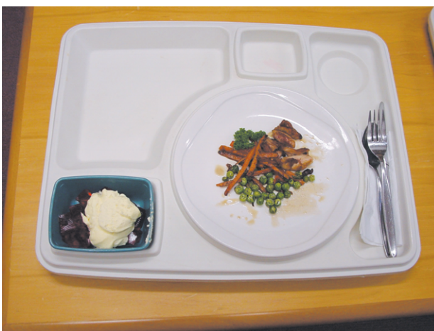
Figure 2. 4:1 ratio lunch for a child age 6 years.

Children are admitted to the hospital for 5 days in which the ketogenic diet is slowly advanced after a 24–48 h fast (panel 2). 9 There is some evidence to indicate that a fast is unnecessary for long-term efficacy. 12 However, we still find it valuable to monitor patients on admission, watch for acute worsening on the diet, educate families, and complete any aetiological assessment. The immediate benefit occasionally seen with fasting can be very reassuring and families have a potential clinical tool to quickly increase ketosis in the future if necessary. 13 Parents tend to be universally more concerned about the fast than the children and are surprised by how easy it is. However, hypoglycaemia (serum glucose <30 mg/dL) during the fast can occur and be symptomatic. We tend to give 30 ml of orange juice in those situations with a follow-up glucose check in 1 h. Drug regimens are not changed for 3–6 months, although we have found an earlier tapering can be safe. 14 Routine use of magnesium, zinc, vitamins D and C, B-complex vitamins, and calcium is recommended.